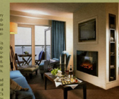
DESIGN WEEK 14.08.08