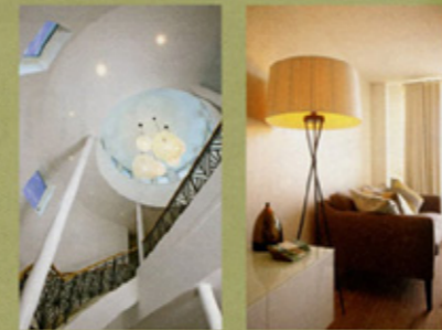
1 The reception at the St Moritz Hotel in Cornwall features restored 1930s leather armchairs

The 48-room hotel, which brothers Hugh and Steve Piggway opened last November, is applying for five-star status. 'Even in the luxury market, excess is not always best,' says Coombe. 'If you've got a bespoke bed in the room, don't crowd it with things, it needs air to breathe in.'