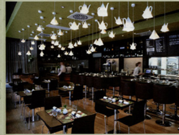
Vincent Hotel, Southport, by DesignLSM